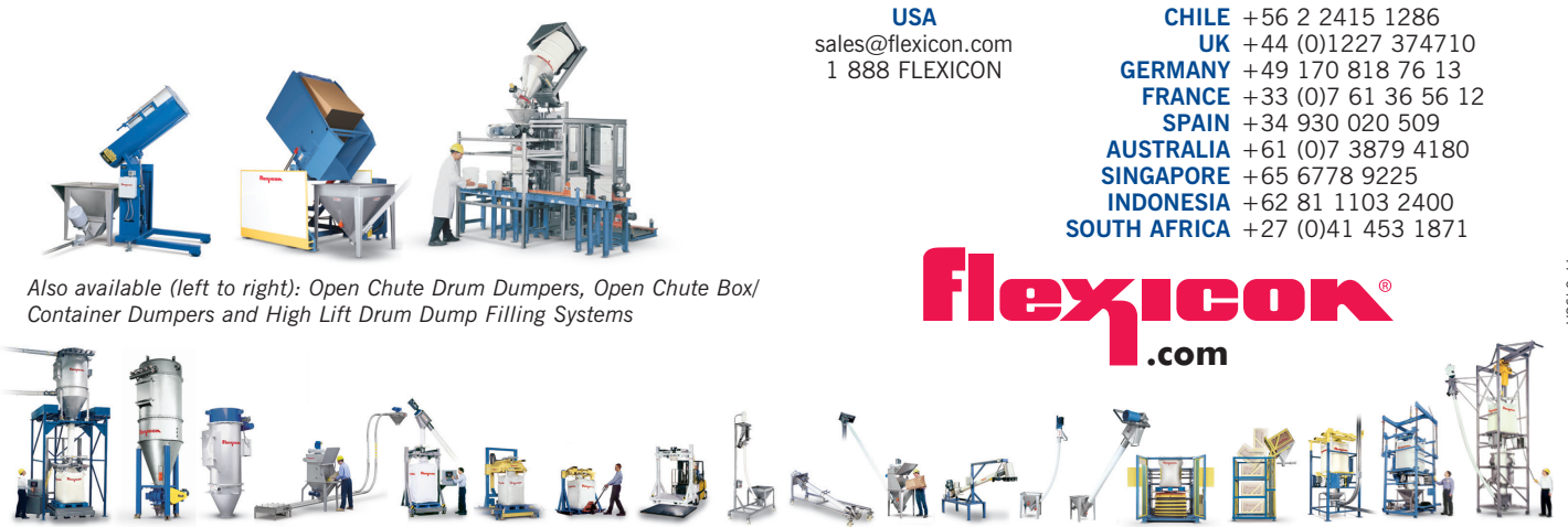
See the full range of fast-payback equipment at flexicon.com: Flexible Screw Conveyors, Tubular Cable Conveyors, Pneumatic Conveying Systems, Bulk Bag Unloaders, Bulk Bag Conditioners, Bulk Bag Fillers, Bag Dump Stations, Drum/Box/Container Dumpers, Weigh Batching and Blending Systems, and Automated Plant-Wide Bulk Handling Systems

Most importantly, all are engineered, manufactured, guaranteed and supported by Flexicon your single-source solution for virtually any bulk handling problem.